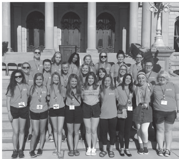
Girls State Participants