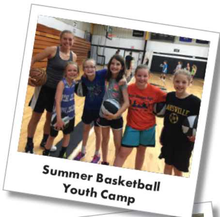
Summer Basketball Youth Camp

We are especially excited about the alignment of this program with our mission to teach our students the vital 21st century skills (communication, creativity, collaboration, critical thinking) needed to be successful in their future life adventures.